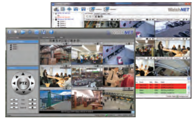
FREE Multisite VMS software included