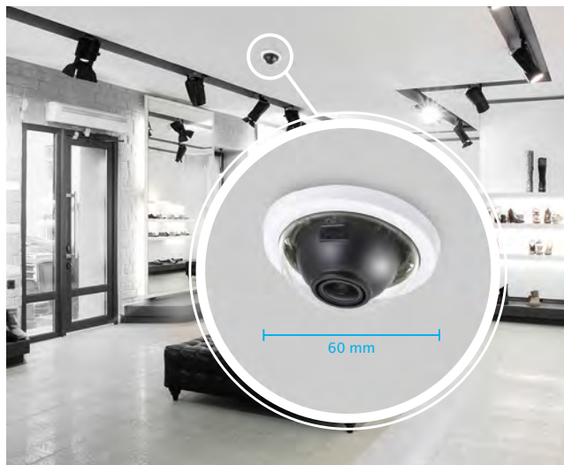
Ultra-mini Recessed-Mount Fixed Dome Network Camera