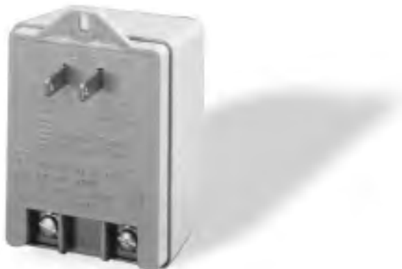
VC24PS-1 POWER SUPPLY