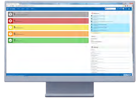
Verint EdgeVMS Op-Center offers remote and centralized enterprise management software for the suite of Verint NVRs.