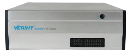
EdgeVR is an enterprise-class, IP-based network video recorder for large-scale, geographically distributed operations.