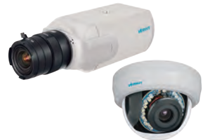
The Verint V3320 series includes two high-definition versions – the V3320FD-DN which is a surface mount dome camera and the V3320BX-DN that is a true box camera.