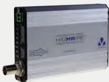
HIGHWIRE POWERSTAR DUO is also available with 2-port POE switch