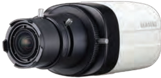
* Lens not included