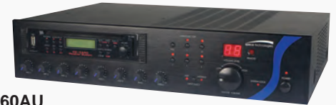
PBM60AU PBM120AU PBM240AU