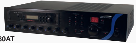
PBM60AT PBM120AT PBM240AT