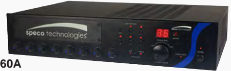
PBM60A PBM120A PBM240A