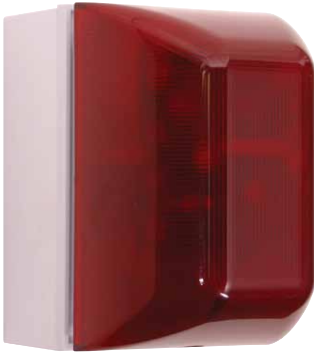
STI-SA5000-R and KIT-71100A-W