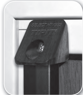
Dark bronze anodized concealed hinge with black TIPIT