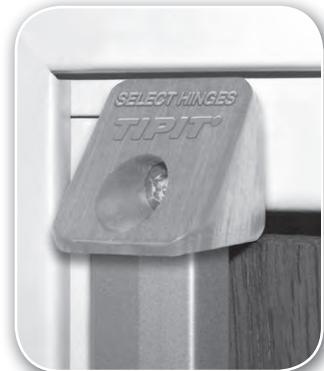
Clear anodized concealed hinge with gray TIPIT