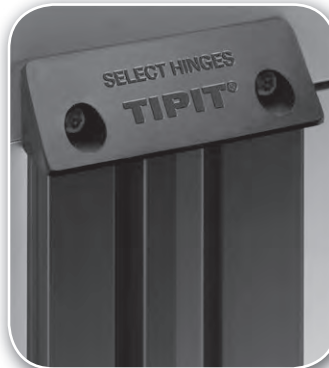
Dark bronze anodized full surface hinge with black TIPIT