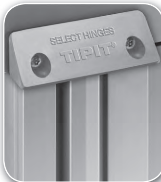
Clear anodized full surface hinge with gray TIPIT