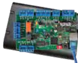
IPPro IP-based Access Control Controller