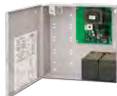
602RF 1 Amp, 12/24 VDC Class 2 Output Power Supply