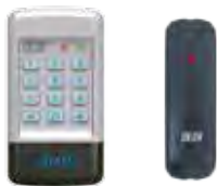
920 IPRW Wiegand Access Control Keypad or Reader