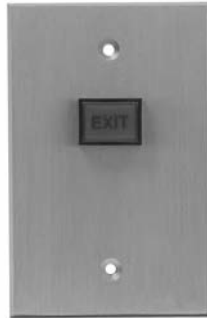
970 3" x 4-3/4" (76.2 x 120.7mm)