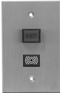
970AUD* 3" x 4-3/4" (76.2 x 120.7mm)