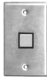
980 2-3/4" x 4-1/2" (69.9 x 114.3mm)

*Audible alert option also available on 970N. Audible Alert may also be ordered as separate item — 903.