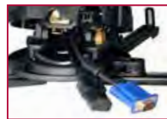
"U" Pitch Bracket for Easy Cable Routing