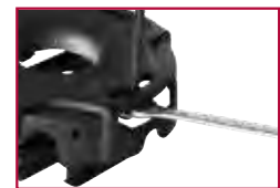
Exclusive Horizontal Wrench Access Slot