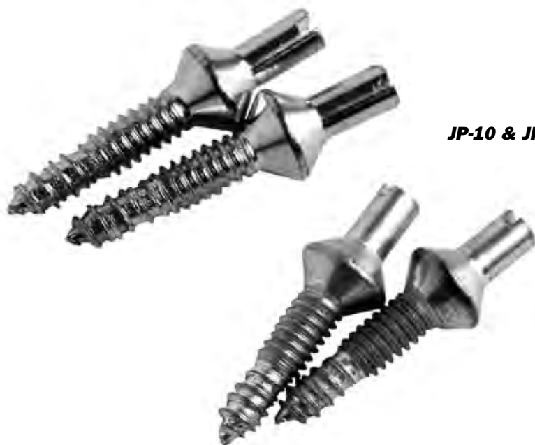
JP-10 & JP-12