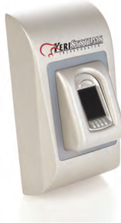
BioSync FP Fingerprint-only