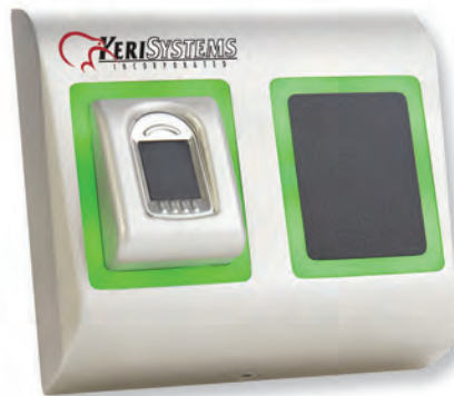
BioSync PR Fingerprint + Proximity