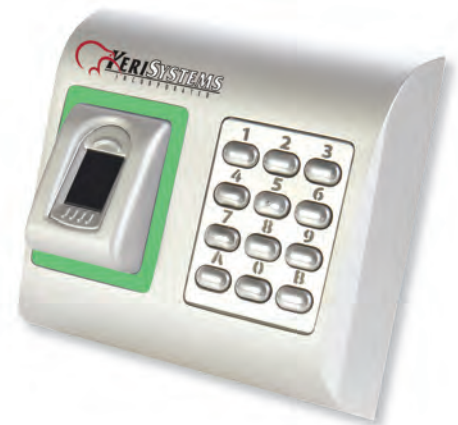
BioSync KP Fingerprint + PIN