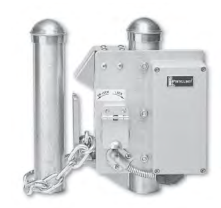
Note: See Page 41 for dimensions