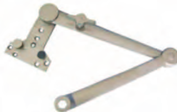
Mechanical hold - open arm with turn and stop for the 9000 series closer 9016-MH