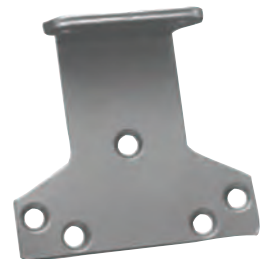
Parallel Arm Bracket