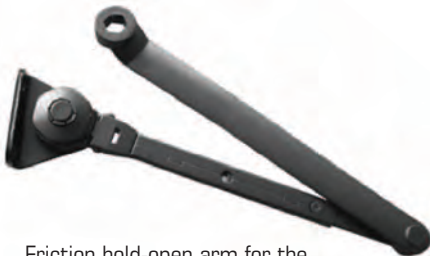
Friction hold-open arm for the 9000 Series closer 9016-H