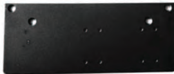
Parallel arm drop plate for 9000 series closer 9016-DP PA