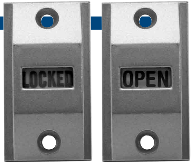
AEXIN (shown in "LOCKED" position)