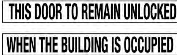
AHS (one of 2 signs shown)

AEXIN Series Lock Indicator: Provides unmistakable notification of an exit door's "LOCKED" or "OPEN" condition. Under many local building safety codes, this allows the use, in certain occupancies, of a security deadlock instead of less secure panic devices. It includes two permanent adhesive multi-header signs: "THIS DOOR MUST REMAIN UNLOCKED DURING BUSINESS HOURS" and "THIS DOOR TO REMAIN UNLOCKED WHEN THE BUILDING IS OCCUPIED."