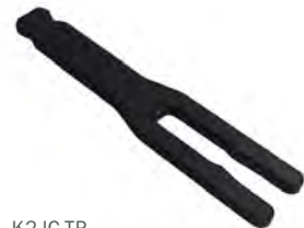
K2 IC TP