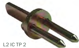
L2 IC TP 2