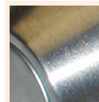
626 U.S. = US26D Satin Chrome