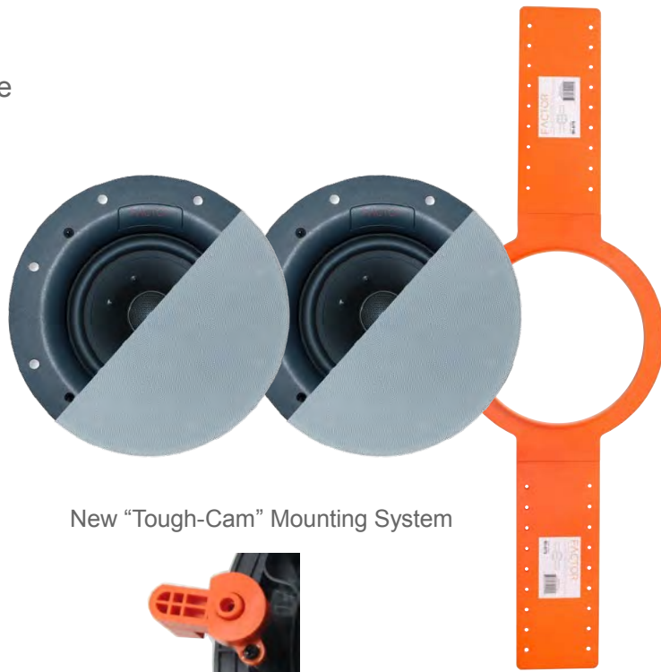
New "Tough-Cam" Mounting System

Dimensions Overall 10.125" (250mm) Cutout Dimensions Speaker 8.25" (210mm) Cutout Dimensions RI Bracket 8.5" (216mm) Depth 3.5" (90mm) Shipping Weight 13lbs (5.9kg) Shipping dimensions 14x12x13"