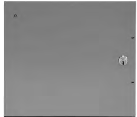
ELR150 Power supply door closed