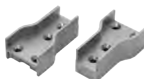
Top and Bottom Mounting Brackets

Minimum order: 1 each. All Accessories can be combined for quantity pricing.