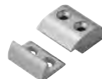
2-Piece Stabilizer for Single Door