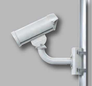
H1 H2 ACCESSORIES WB1 JB1 SS1 PMA1 Pole mount adapter