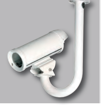
Optional ceiling bracket (Model JB1)