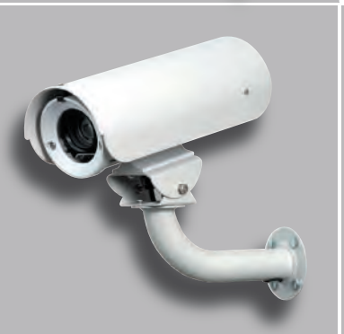
Optional sunshield (Model SS-1) for high temperature environments