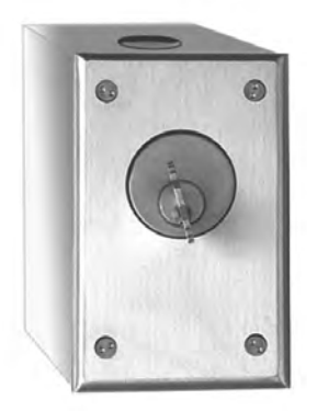
CM-1000 Shown with mortise cylinder (sold separately)