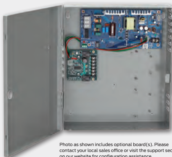
Photo as shown includes optional board(s). Please contact your local sales office or visit the support section on our website for configuration assistance.