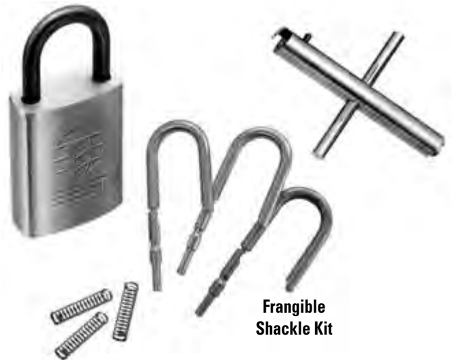
Frangible Shackle Kit