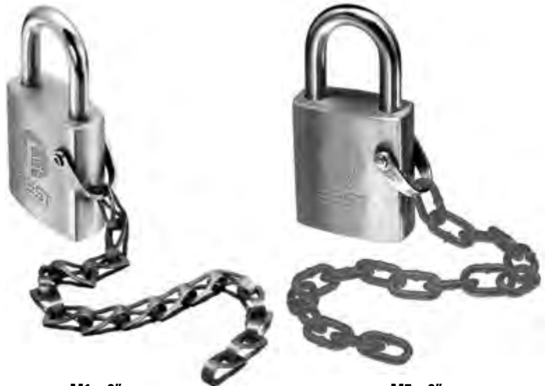
M1 – 9" Bronze Chain

Chains may be supplied with padlock. When ordering clevis and chains, add M1 or M5 to padlock nomenclature. Standard chain length is 9", special length chains available upon request.