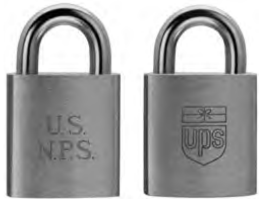
Samples of Padlock Stamping

Upon special request, and at no charge other than the initial cost of the die, Stanley/BEST padlocks may be die-stamped with the customer's identification as specified. If stamp has been previously ordered, specify stamp number. (Brass padlocks only.)