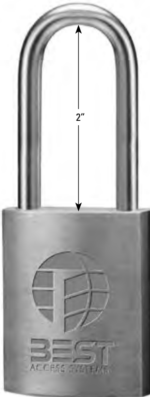
11B772 Actual Size