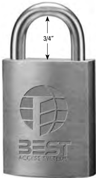
11B72 Actual Size