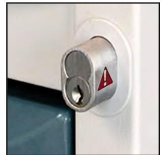
For medical/medication cart use. Red caution flag alerts staff when unlocked.