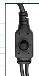
In-Line Cable Mounted OSD Control