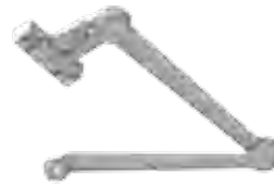
4040XP-3077CNS Cush-N-Stop ® Arm