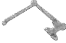
4040XP-3049SCNS Spring HCUSH Arm