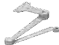
4040XP-3049EDA Hold-Open Extra Duty Arm