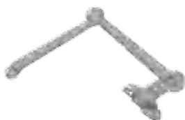
4040XP-3077SCNS Spring CUSH Arm