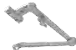
4040XP-3049CNS HCUSH Arm