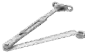
4040XP-3077L Long Arm