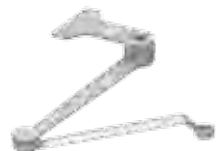
4040XP-3077EDA/62G Extra Duty Arm with 62G