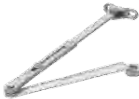
4040XP-3077ELR Extra Long Arm