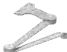
4040XP-3077EDA Extra Duty Arm