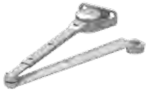
4040XP-3049 Hold-Open Arm