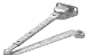
4040XP-3049L Long Hold-Open Arm