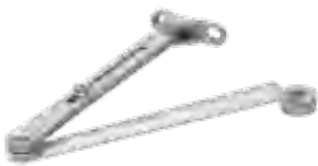
4040XP-3077 Regular Arm