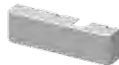
4040XP-72MC Metal Cover