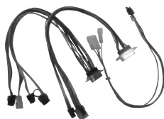
8310-3134 Retrofit Cable Kit