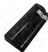
8310-845 Programmable Relay Module