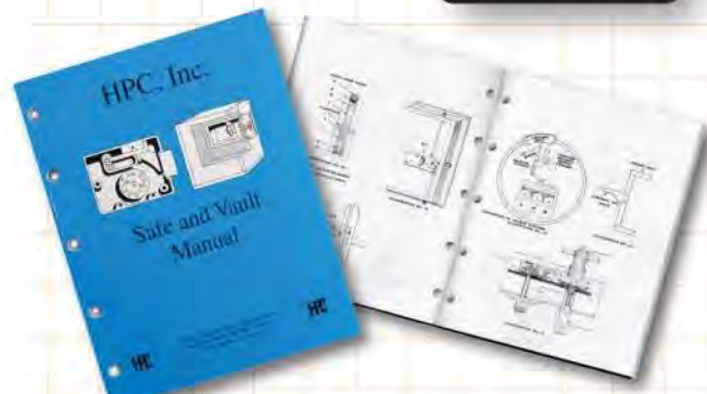
Safe and Vault Manual No. SVM