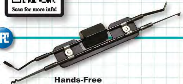
Hands-Free Tension Tool Kit No. HFTT-KIT

HPC's Hands-Free Tension Tool Kit takes the difficulty out of picking! No need to fumble with the tension. Simply slip the Hands-Free Tension Tool into the cylinder keyway (vertical or horizontal), slide and set the weight to adjust the amount of tension and then let go! All that's left is raking the pins! The kit comes complete with the Hands-Free Tension Tool and a matching 2-sided Rake/Diamond Pick. The Tension and Picking Tools clip together with a specially designed holder. Difficult locks will become easier to pick, and simple locks will pick quicker with ease.