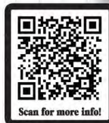
Flip-It™ Plug Spinner No. FIT-2

HPC's Flip-It™ is an incredibly handy tool that gets you out of a tough situation. When picking a lock in the wrong direction (intentionally or by error), the Flip-It™ will flip the cylinder plug past the upper pins and save you the job of repicking. The Flip-It™ has two exclusive features. The two pin Quick Lock/Release feature allows for easy release of the rotating action. The sure stop feature prevents overwinding in either direction. It's a perfect complement to your HPC pick set. (No. FIT-BLADE Blade only).