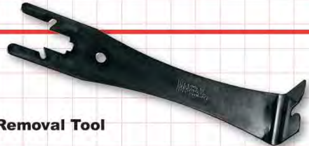
Clip & Crank Removal Tool No. AST-3

The Clip & Crank Removal Tool easily removes the hard to reach retaining clips without damage. These clips can be found on GM, Ford, Chrysler and various other vehicles.