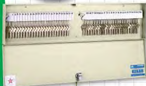
Horizontal KeKab® No. KEKAB-H48