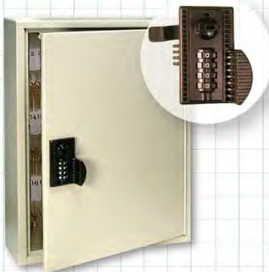
4-Wheel Combo KeKab® No. KEKAB-4W65

The 4-Wheel Combo KeKab® offers an economical keyless locking option for organizing keys. The 4-wheel lock combination has 10,000 available combinations and a key override, included. The mechanical lock comes with a decoding pin and the combination can be easily changed when necessary. Just like the rest of HPC's KeKab® line, the cabinet is made of heavy-gauge steel and finished with powder textured paint in neutral sand color. The 4-Wheel Combo KeKab® holds 65 keys and comes complete with numbered tags, out tags and control chart.