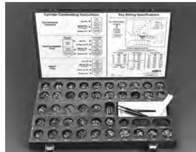
PK-70-ZDH PK-70-X PK-70-N

Contains sample Master Keyed Cylinders and information materials.