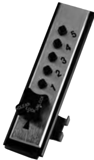
D901 x US4