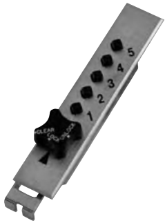
D900 x US26D