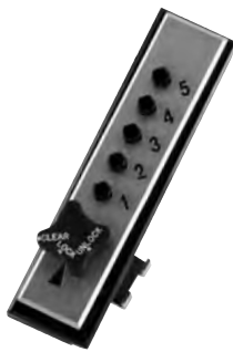
D901 x US26D