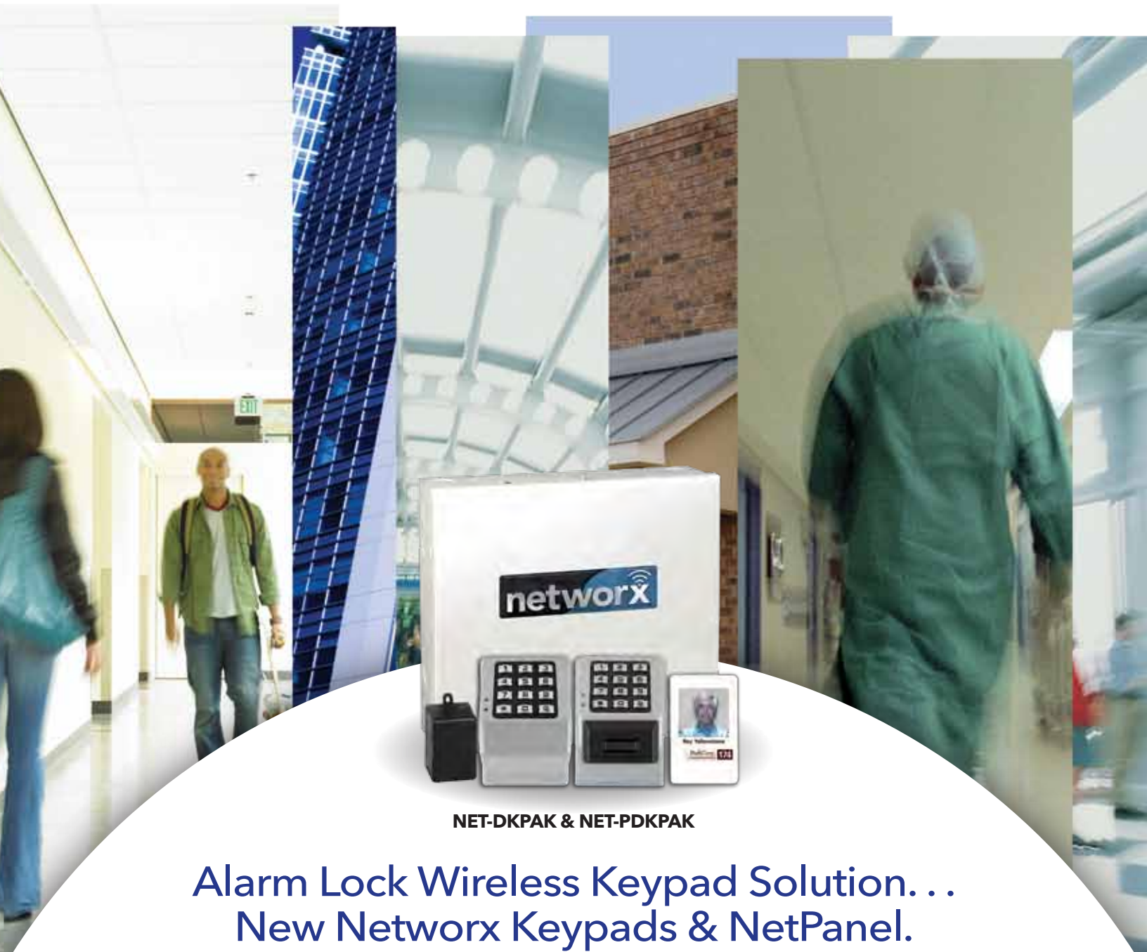
NET-DKPAK & NET-PDKPAK