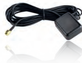
TIMENET Pro comes with antenna and 5 metre cable included