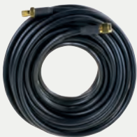
TIMENET Pro Antenna Extension Cable 10 metres