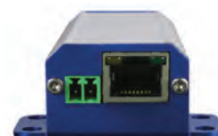
HIGHWIRE Longstar Ethernet and DC input