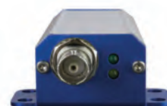
HIGHWIRE Longstar Coax and status LEDs