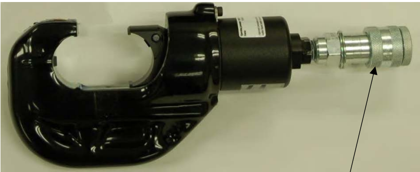
CT-920CH • CT-920CH/CV CRIMP HEAD TOOLS

3/8" FEMALE PARKER FITTING ON BOTH CRIMP HEADS