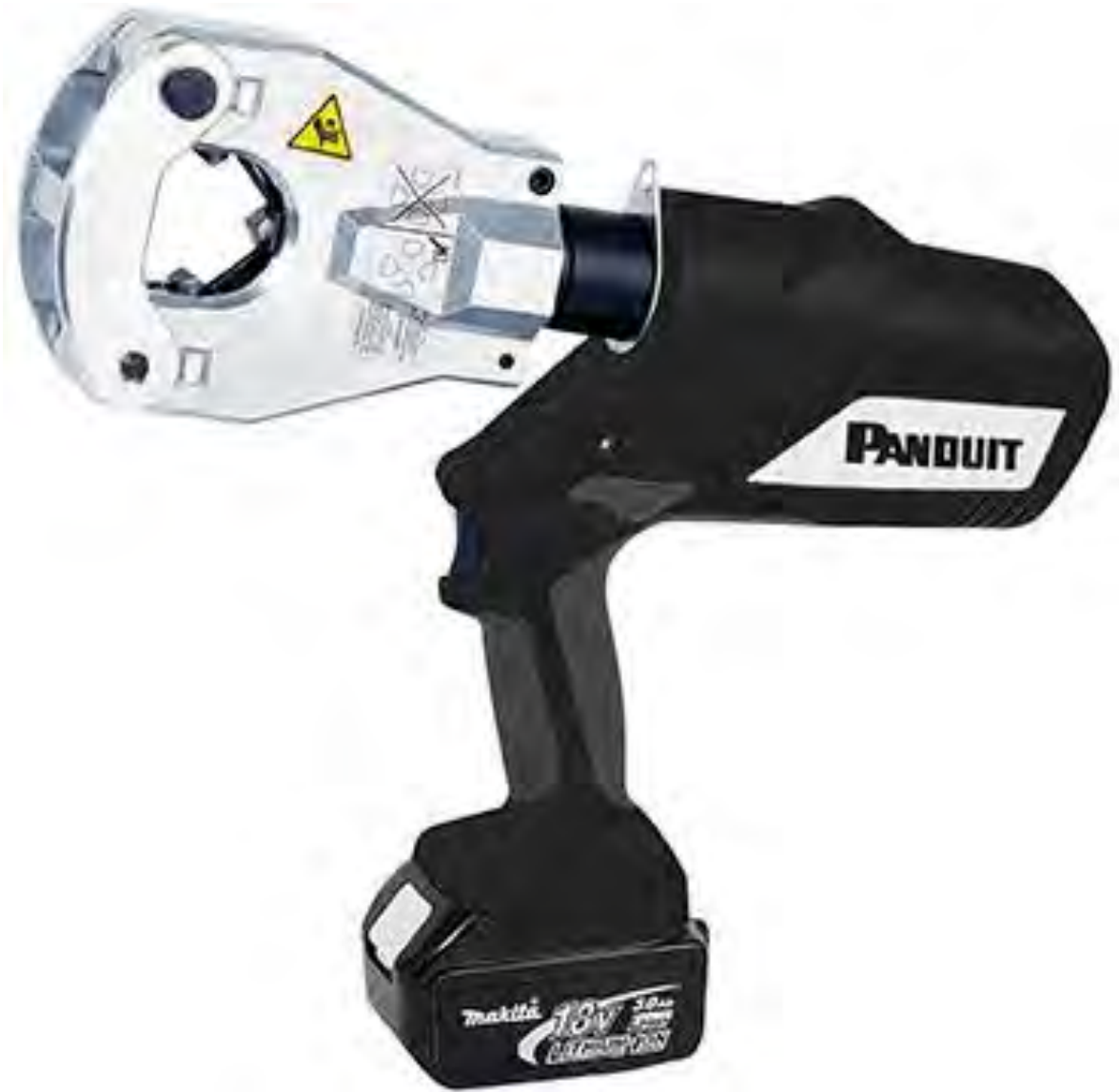
CT-2980/ST • CT-2980/STINT • CT-2980/STUK • CT-2980/STAUS • CT-2980/TO DIE-LESS CRIMP TOOL

This tool meets requirements of Safety for Hand Heldheld, Motor-Operated Electric Tools specification UL 60745-1 and CSA C22.2 No 60745-1. Tool is listed under CSA file number 268531.