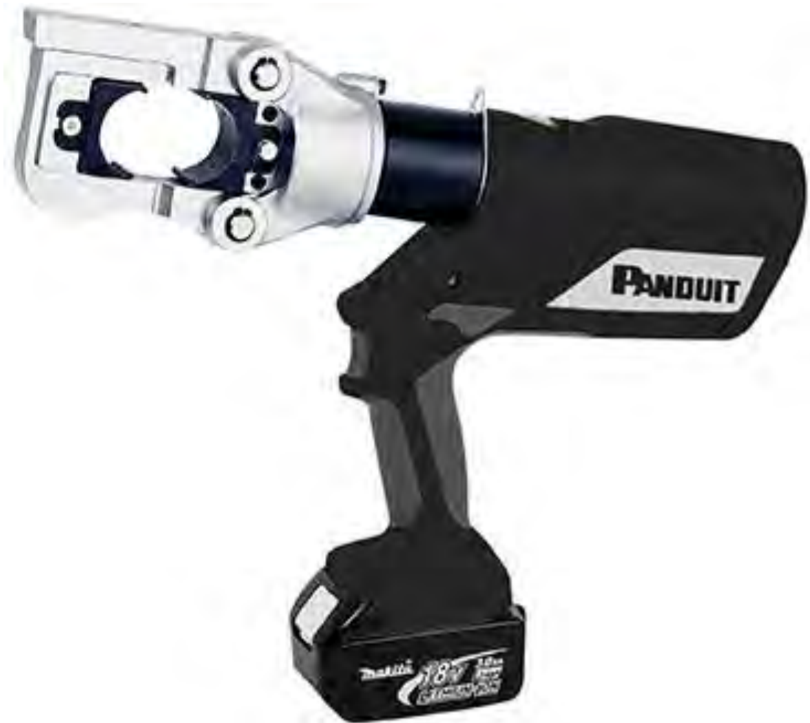
CT-2920/CCP • CT-2920/CCPINT • CT-2920/CCPUK • CT-2920/CCPAUS • CT-2920/CCPTO MULTI-USE (CRIMP • CUT • PUNCH) TOOL

This tool meets requirements of Safety for Hand Heldheld, Motor-Operated Electric Tools specification UL 60745-1 and CSA C22.2 No 60745-1. Tool is listed under CSA file number 268531.