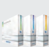
EntraPass Security Software