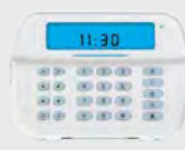
DSC Alarm Panels