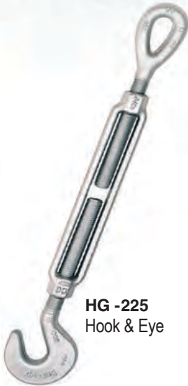
HG -225 Hook & Eye

Meets the performance requirements of Federal Specifications FF-T-791b, Type 1 Form 1 - CLASS 6, and ASTM F-1145, except for those provisions required of the contractor. For additional information, see page 452.