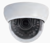
Shown with included paintable, snap-on *Chameleon Cover™