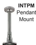
INTPM Pendant Mount