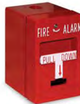
RMS ( ) WP