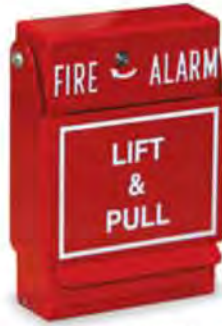
RMS ( ) LP