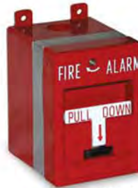
RMS-EXP ( )