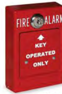
RMS ( ) KO