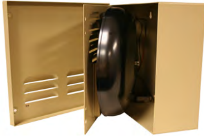
ABB-1033 12VDC MOTOR BELL AND BOX