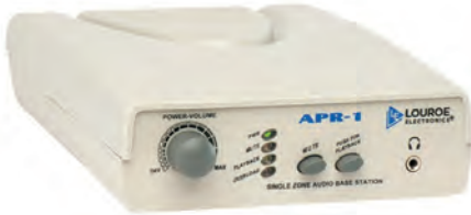
APR-1 Base Station

The ASK-4® #102 is a single zone audio monitoring system designed to interface with a DVR, VCR or other recording devices that accept line level input. The APR-1 Audio Base Station contains a built-in 3" speaker and volume control for producing live audio and audio playback. The Verifact® D is an omnidirectional pre-amplified microphone that produces line level output.